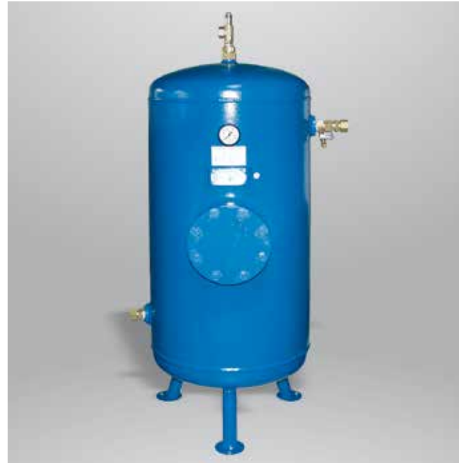
Form B: stehend