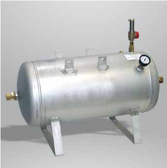
Form A: liegend