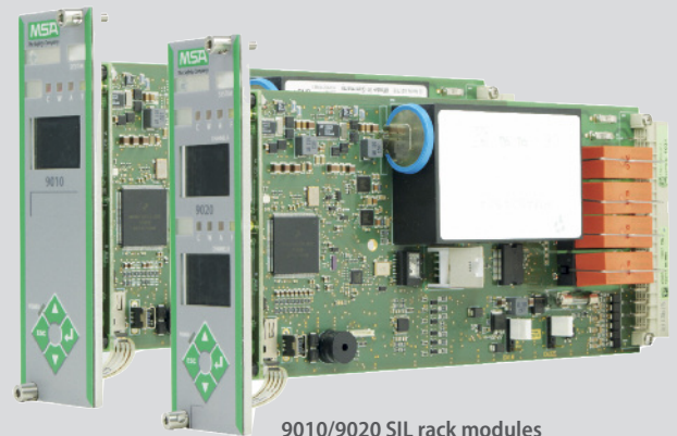
9010/9020 SIL rack modules