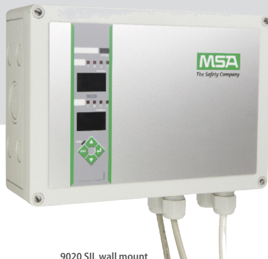
9020 SIL wall mount