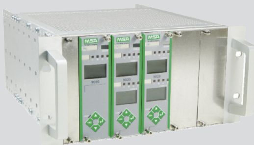
9010/9020 SIL 19" rack, 5 modules