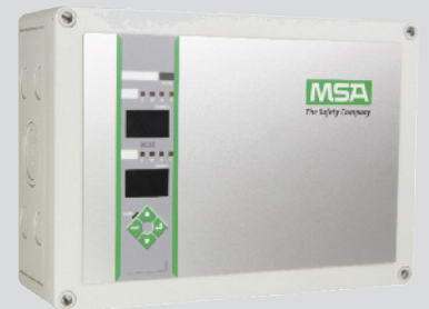
9020 SIL wall mount