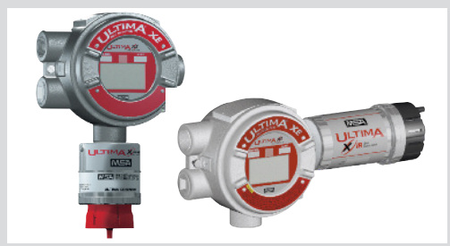
ULTIMA X Series